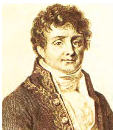
JEAN-BAPTISTE JOSEPH FOURIER (March 21, 1768–May 16, 1830)

He himself was neglected for his work on inequalities, what he called “Analyse indéterminée.” Darboux considered that he gave the subject an exaggerated importance and did not publish the papers on this question in his edition of the scientific works of Fourier. Had they been published, linear programming and convex analysis would be included in the heritage of Fourier.