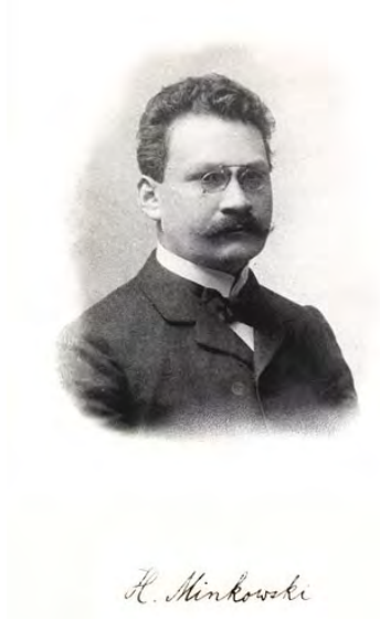
HERMANN MINKOWSKI (June 22, 1864–January 12, 1909)